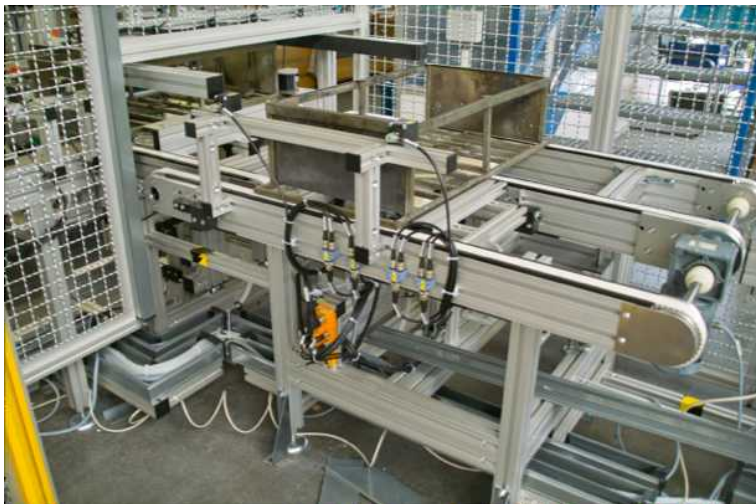
Interlinking Soldering furnace for oil coolers, WP carrier return