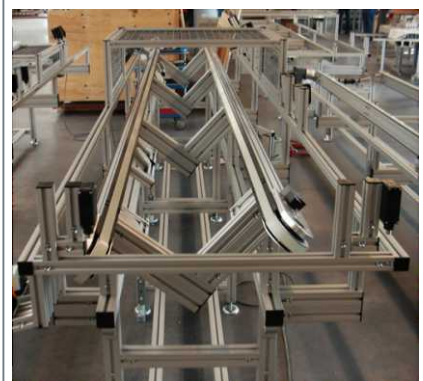
Interlinking Shell construction assembly "Sheet metal part supply for tailgate"