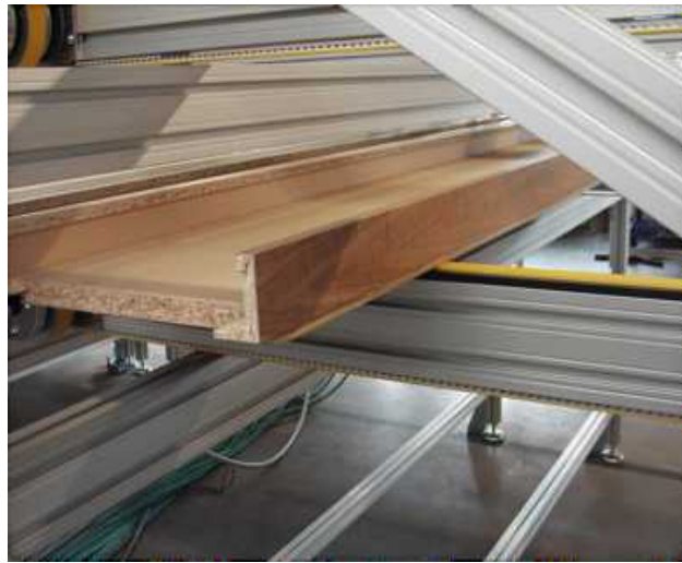
Buffering system Door frames