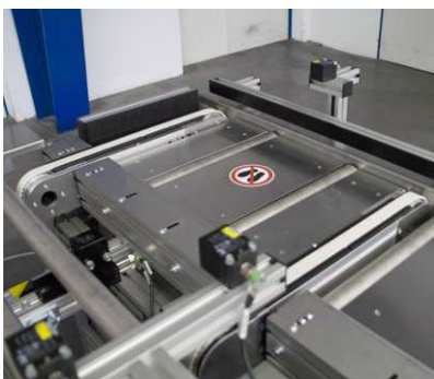
Timing belt conveyor as lift/transverse unit in a roller conveyor system